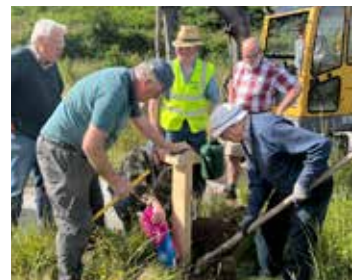
The team hard at work. Managers watching, workers working!