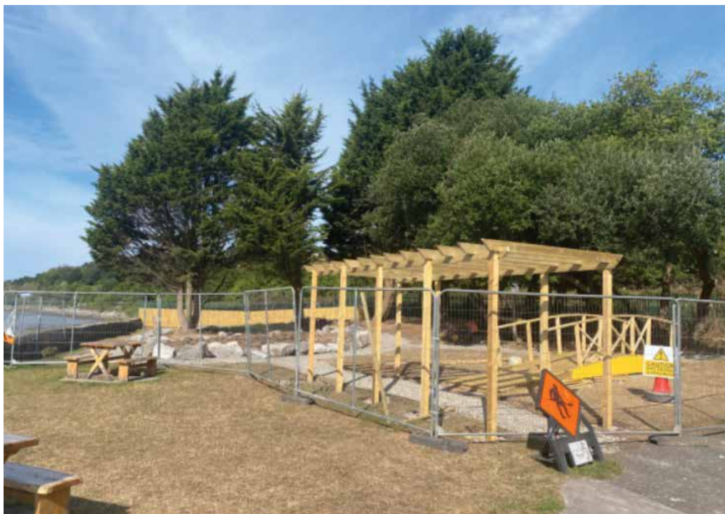
The Sensory Garden in Progress

The CoCoCo team are to be congratulated on their efforts and making the €25,000 grant received from central Government stretch to provide a wonderful new facility that will enhance our community greatly. The Tidy Towns team look forward to the planting out and presenting it in the 2023 Tidy Towns competition in June next year, when it should be well established and ready for judging.