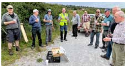
The team enjoying a mini break and Fitzpatrick's sandwiches