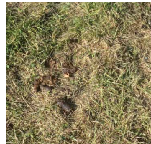
Dog Deposit (1 of many) in Craig's Field

We are in touch with Cork County Council and with the Dog Warden on this matter as our amenities cannot be ruined by a few.