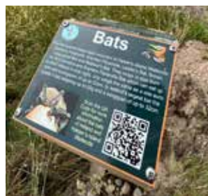
Bat's Sign - QR Code Link

Local entities that helped here included Carraig Print (signage), European Quality Hardwoods (timber), Birdwatch Ireland (signage design, photographs and web copy material), Cork County Council , Glounthaune Tidy Towns and Glounthaune Men's Shed .