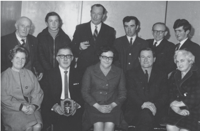
Committee of Glounthaune Winners of Tidy Villages Competition 1967, 68, 69