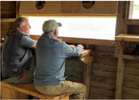
The new Borrow Dyke viewing Arrangements

The Men's Shed have been working with Birdwatch Ireland and have experimented on optimising the window configuration in one position with a view to (no pun intended) rolling out this design to all the other viewing positions if successful. The windows have been lowered, widened, and narrowed and bench seating raised.