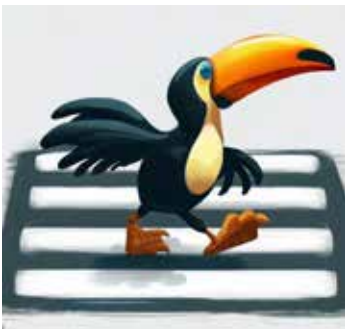
Glounthaune Railway Station Toucan Crossing Year Two and STILL NOT WORKING