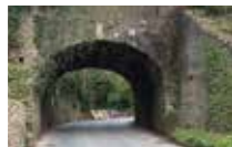
Old Red Sandstone & Limestone: Sacred Heart Church, Glounthaune Limestone: Lackenroe Bridge 'The Dry Bridge'