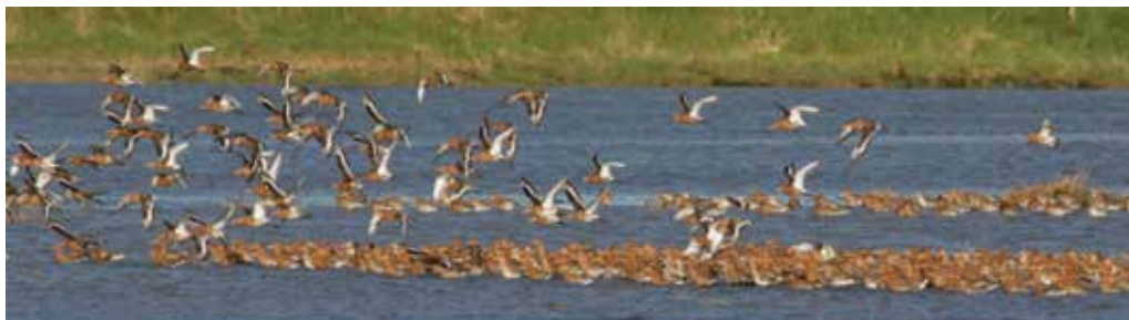
Internationally important numbers of Icelandic Black-tailed Godwits at Harper’s Island Wetlands preparing to migrate to Iceland for the breeding season.

Prior to this community initiative (kicked off in 2015) the site had been effectively abandoned and used for unmanaged horse grazing.