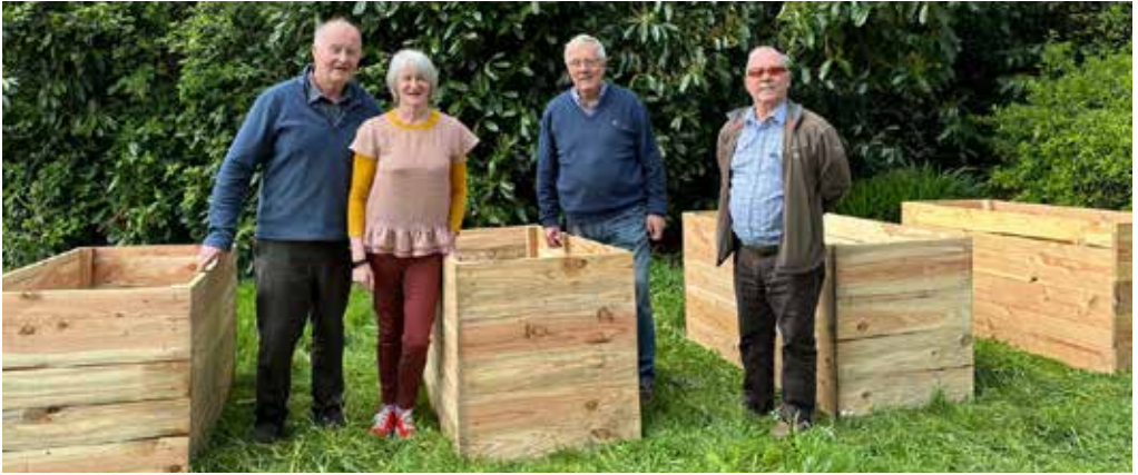
The Men's Shed installed 4 grow boxes for Cobh Mentally Handicapped to grow Vegetables.