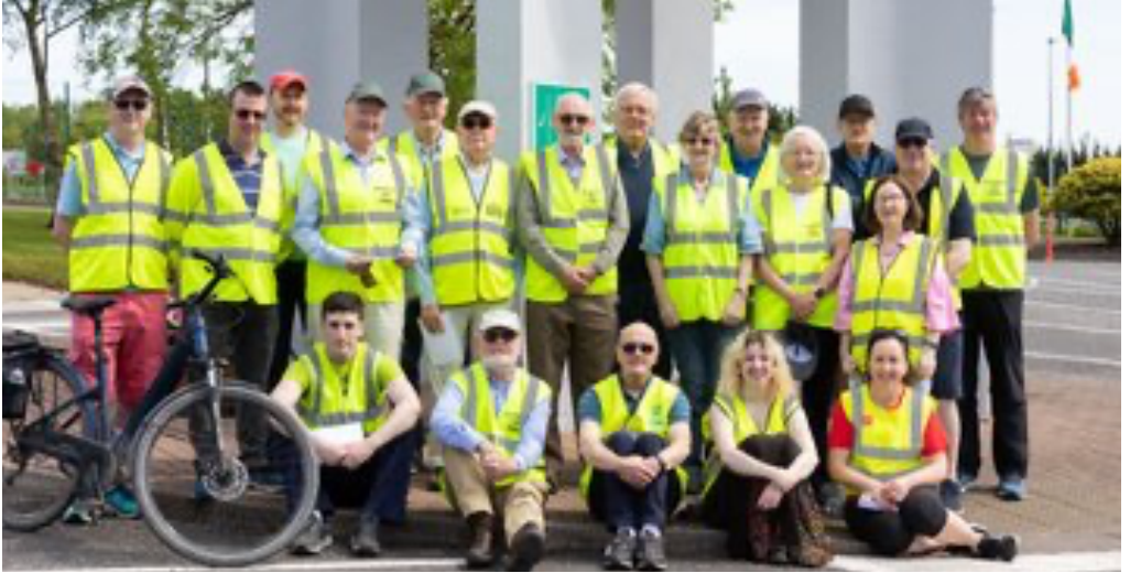
Local Volunteers who organized the event in conjunction with the CCC.

The official opening of the new section of the Greenway took place in May with a family cycle. It was organised by local volunteers and Cork County Council (CCC) . It included an ice cream stop and a bike quiz for children. A very successful and enjoyable day.