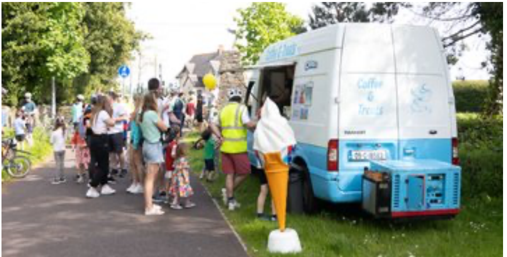
Ice Cream Van for all participants.