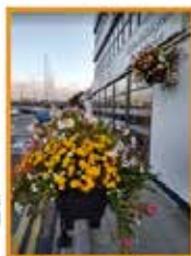
Bidens mixed in

Mix the following plants into your hanging basket to make it pollinator-friendly: Bidens , Bacopa