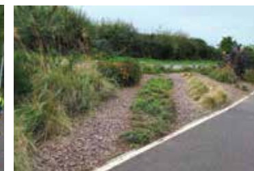
Far Left: Before the Clean-up