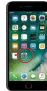
Fig 2 - finding the Accessibility option - tap on this to open up some powerful and useful features