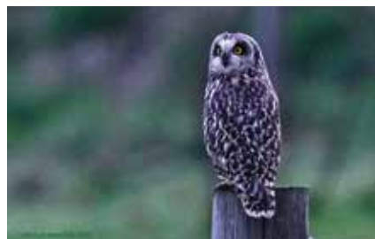
Short-eared Owl Harper's 22nd Feb 2024 Wetlands Nature Reserve volunteers.