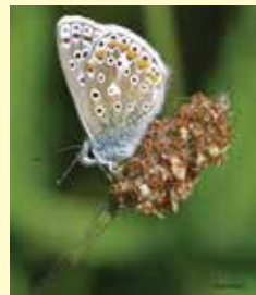
Common Blue Butterfly