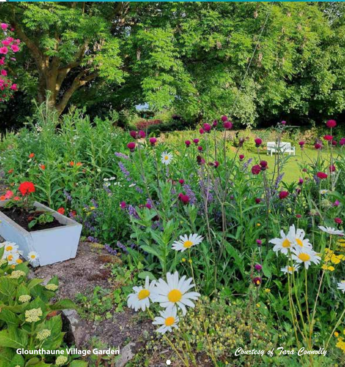
Glounthaune Village Garden